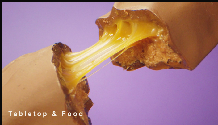
Tabletop & Food